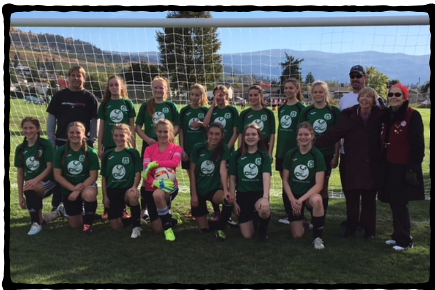
Soccer Team sponsored by the Westbank Lioness Club

As a service club, The Westbank Lioness Club contributed many volunteer hours to the community. The Lionesses were involved in many activities including planting flowers and undertaking the fall cleanup at Brookhaven Care Centre, and hosting summer barbecues for the residents and staff. Other volunteering initiatives included the cleanup of Shannon Lake Road, collecting used eyeglasses for shipment to countries in need, and participating yearly in the Big Bike Ride for the Heart and Stroke Foundation.