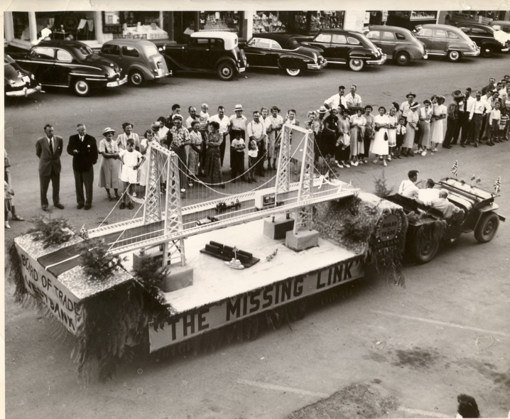
The float entered by the Westbank Chamber of Commerce depicting "The Missing Link" won first place in the 1950 parade.