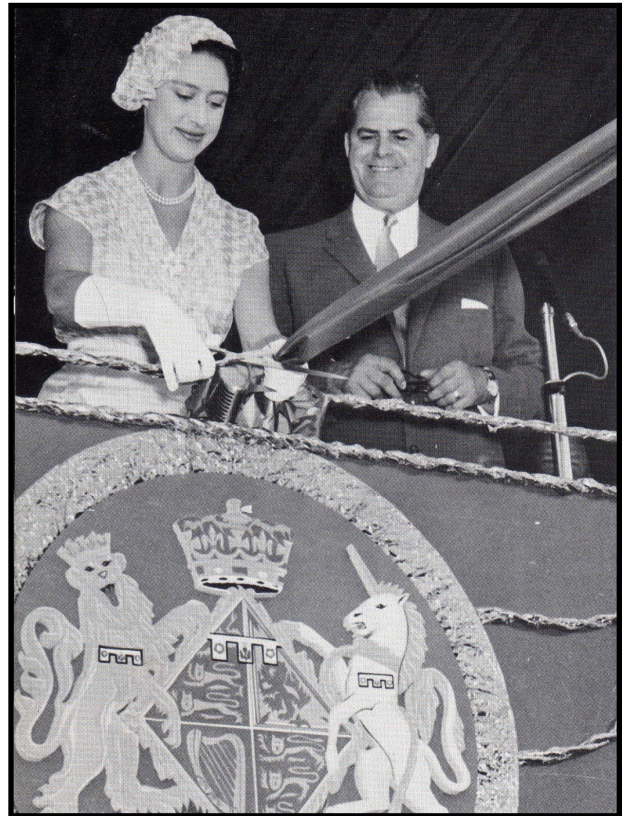
Princess Margaret and W.A.C Bennett cut the ribbon to officially open the Okanagan Lake Bridge on July 19, 1958.

Although there were frustrating times, especially in the latter years when traffic was tied up longer than planned because of the lift span not operating the way it should (jammed in the up position, or not aligning properly with the highway in the down position), this first bridge served our two communities well for 50 years!