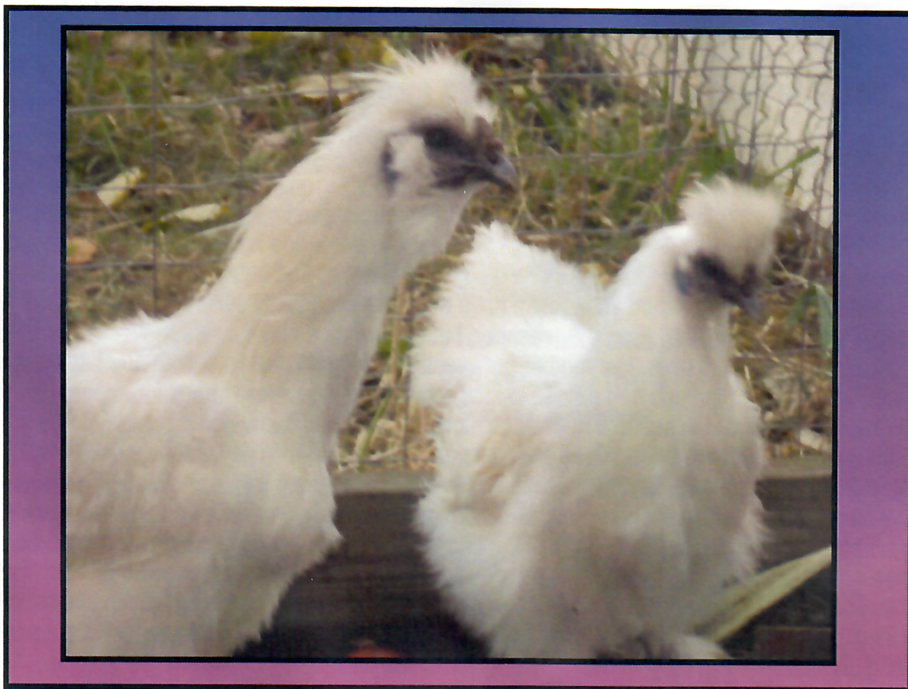
Local furry chickens awaiting dinner!